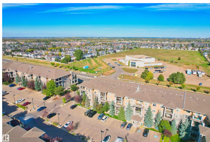
250-11517 Ellerslie Rd SW, Edmonton, AB