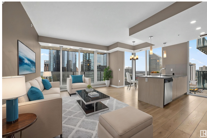
1404-10180 103 St NW, Edmonton, AB

Main Floor Exterior Area 1442.00 sq ft Interior Area 868.60 sq ft