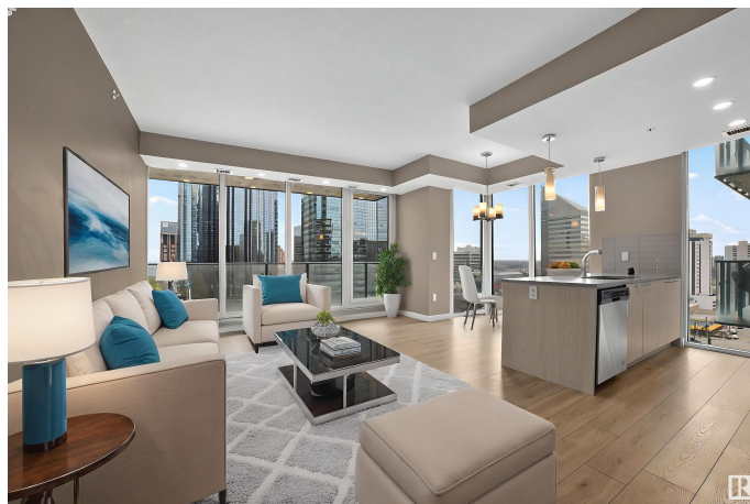
1404-10180 103 St NW, Edmonton, AB

Main Floor Exterior Area 1442.00 sq ft Interior Area 868.60 sq ft