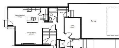
Main Floor Plan 824 sq. ft.

▶ 26' Pocket Two Story ▶ Legal Basement Suite (optional) (1 or 2 bedroom options available)